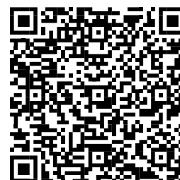
School Home Provision (2020)