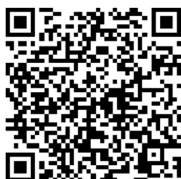
Directives and Guidelines for Inclusive Education (2020)